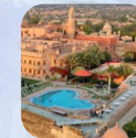
Khimsar Fort \ (95 km)