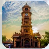
Clock Tower & Sardar Market