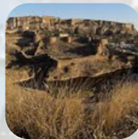
Rao Jodha Desert Rock Park