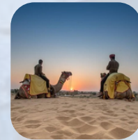
Osian Desert Safari (65 km)