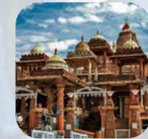
Osian Temple (65 km)