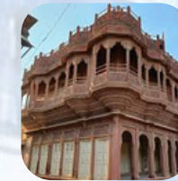
Kheechan Village (170 km)