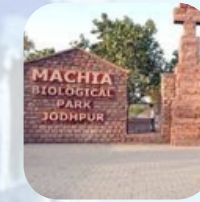
Machia Biological Park

WELL CONNECTED TO ALL THE MAJOR CITIES BY AIR, ROAD & TRAIN