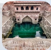
Toorji Ka Jhalra (Stepwell)