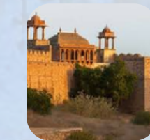
Nagaur Fort (135 km)-