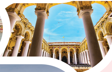
Thirumalai Nayakar Mahal