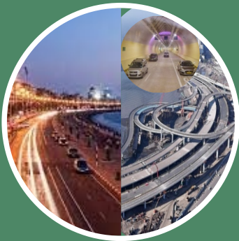
Marine Drive & Coastal Road