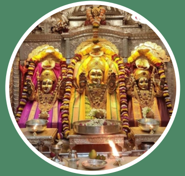
Shri Mahalaxmi Temple