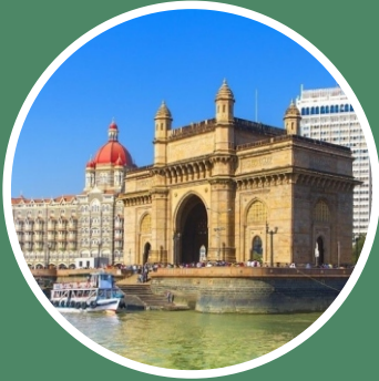
Gateway of India & Taj Hotel