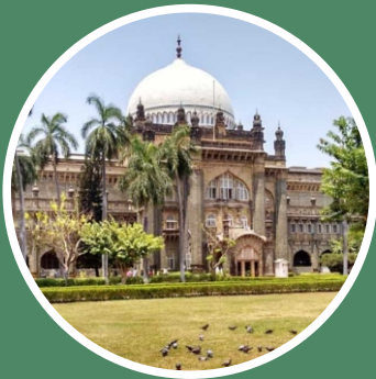
Prince of Wales Museum