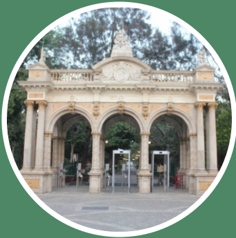
Jijamata Udyan (Zoo)