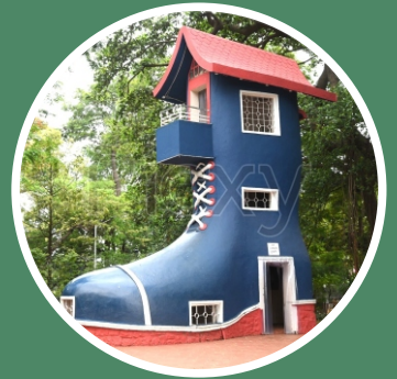
Boot house- Hanging garden