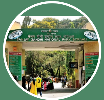
Sanjay Gandhi National Park