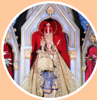
Mount Mary Church