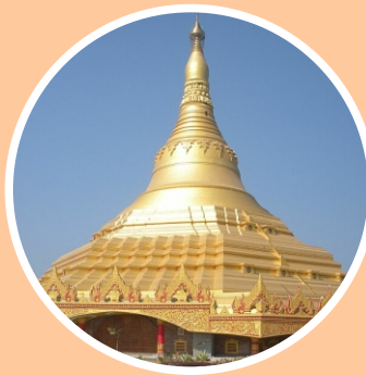
Global Vipassana Pagoda