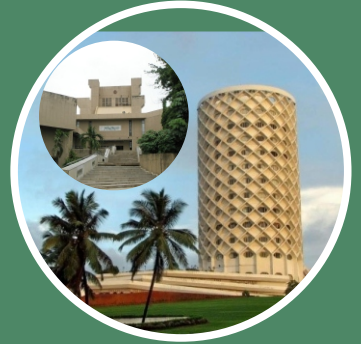
Nehru Planetarium Science Centre