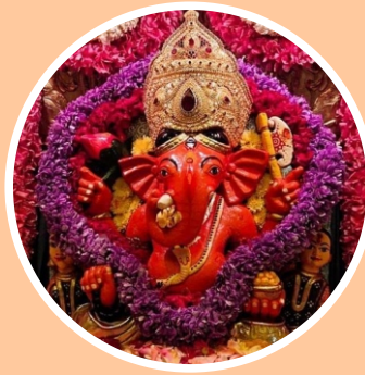
Shree Siddhivinayak Temple