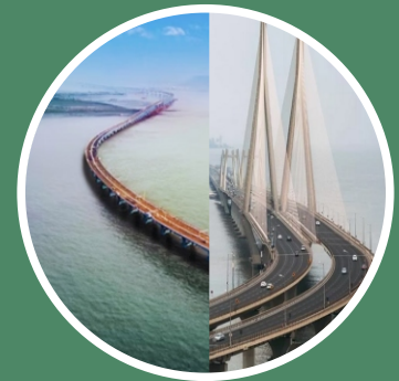
Atal Setu & Bandra & Worli Sea Link